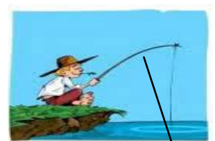
a fishing line

One fine morning, a man was fishing in a river. The sun was shining and the man (sat – was sitting – sit) on the river bank. (Fishing – Fish – Fisher) was his favourite pastime. Everything was very quiet and peaceful. The man was waiting patiently, when suddenly he stood up (quickly – slowly – sadly) and began to take in the line. There (was – were – are) a big fish but it fell back into river. At first, the man didn't know what happened. Then he (looked – look – was looking) carefully at his fishing line. It was empty. The poor man was so (disappointed – happy – satisfied) that he packed away all his things and went home.