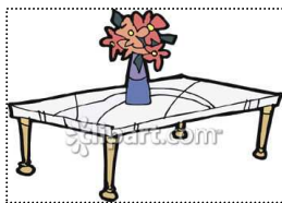
a) The vase is ..... the table

On – in the middle – on the right – on the left – next