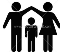
b) The boy is .....