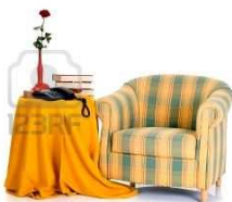
c) The sofa is ..... to the table.