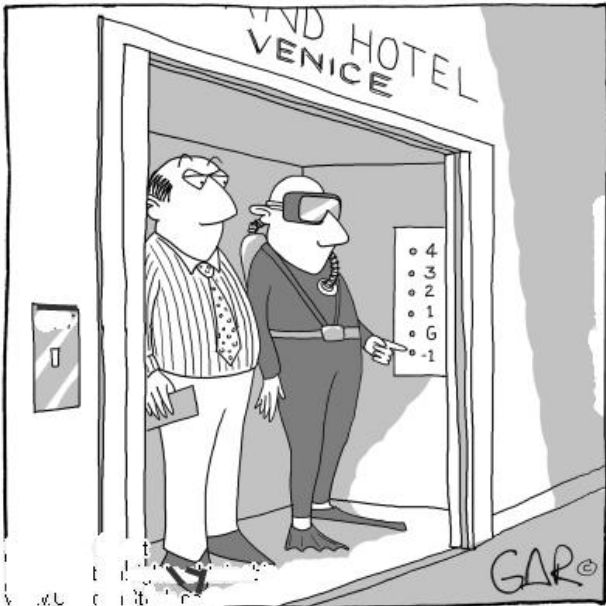
2/ a lift