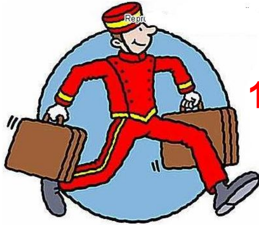
1/ a porter