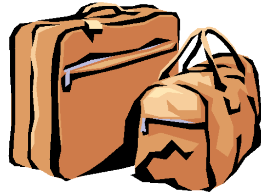
4/ luggage (suitcases)