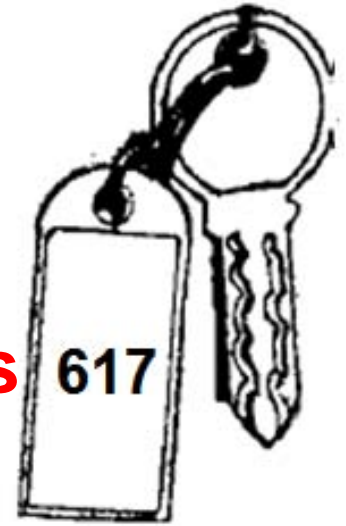
3/ (Room )keys